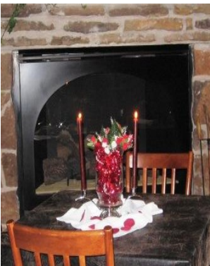
Call for more details!

We hope that the "Live" Check Card System will make using your check card much more convenient and user-friendly. If you have any questions about the "Live" Check Card System, please contact the credit union at 432-9044.